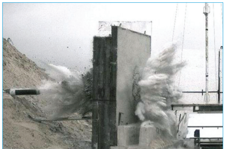
MPR-500 Made by Israel's Military Industries.

After blowing the first hole in the targeted underground site, the next bombs continue to extend and deepen it.