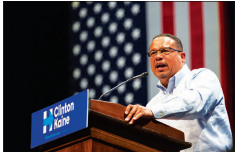
Rep. Keith Ellison speaks at a Hillary Clinton campaign event at the University of Minnesota in October.