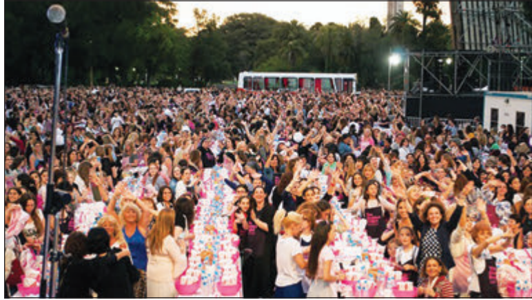
The Shabbat Project in Buenos Aires ( The Shabbat Project )