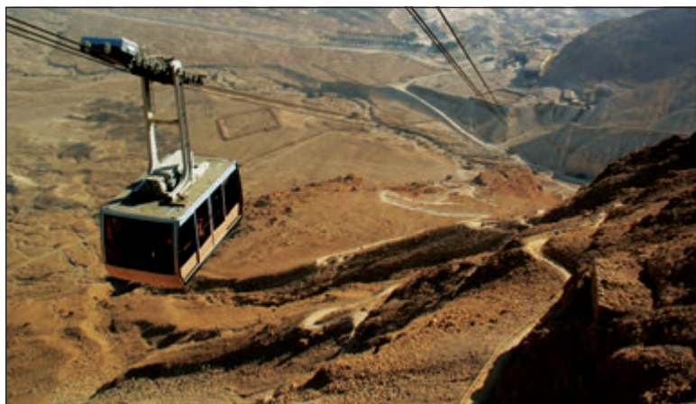
A cable car ascending the Masada fortress, one of Israel's most popular tourist destinations.

A record number of North Americans have traveled to Israel so far this year, and Israeli tourism officials expect to finish out 2016 with a 5-percent increase during the last year.