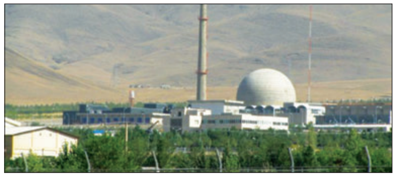
Iran's heavy water nuclear facilities near the central city of Arak.

"It is important that such situations should be avoided in future in order to maintain international confidence in the implementation" of the deal, Yukiya Amano, director general of the International Atomic Energy Agency, said last week in Vienna.