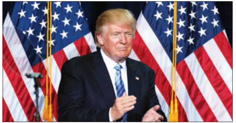
Donald Trump.

Following Trump's election victory, Hamas spokesman Sami Abu Zuhri said the identity of the U.S. president makes little